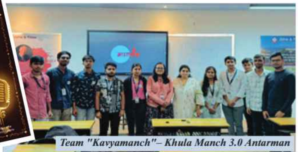
Team "Kavyamanch" – Khula Manch 3.0 Antarman