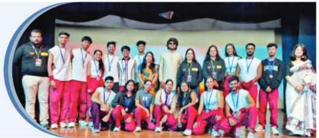
Symagine – 2026 31 st Jan, 2026