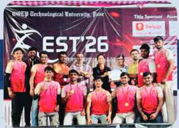
RSCOE Kabbadi Team