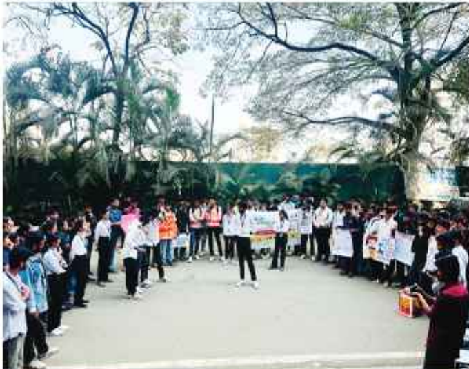
Street Play at RSCOE Campus

actively participated and spread awareness through Street play and safety messages. The rally was successfully conducted and helped encourage a strong culture of electrical safety among participants and the community.