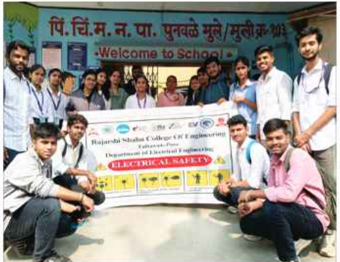
Street Play at PCMC PRIMARY SCHOOL