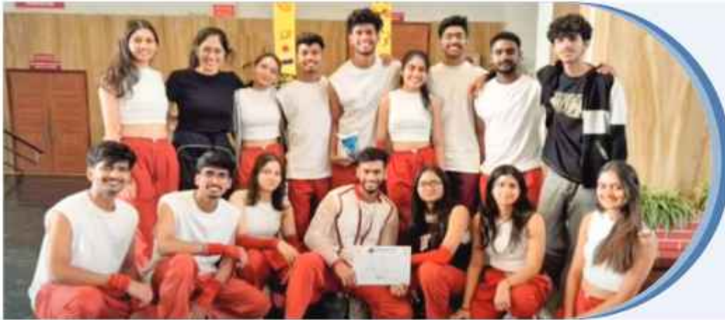
Transcend 2026 (SIBM) 22 nd Jan, 2026