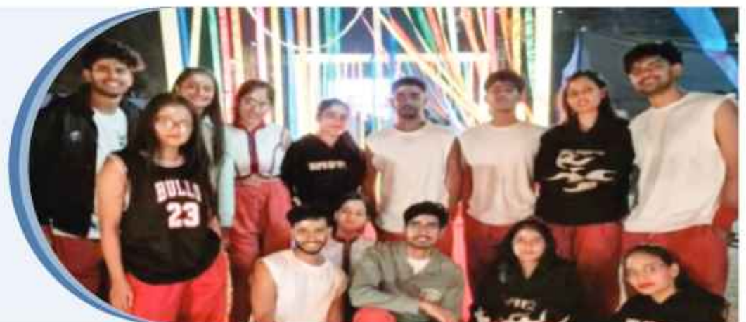
Adhikosh 2026 (NIBM) 17 th Jan, 2026