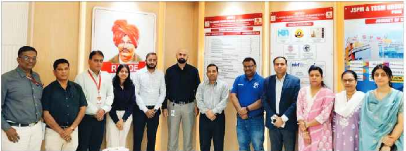
➤ Industry–Institute Engagement & Strategic Interaction of Capgemini