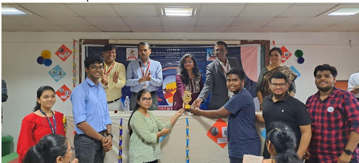
Felicitatation of team Rang Bhumi