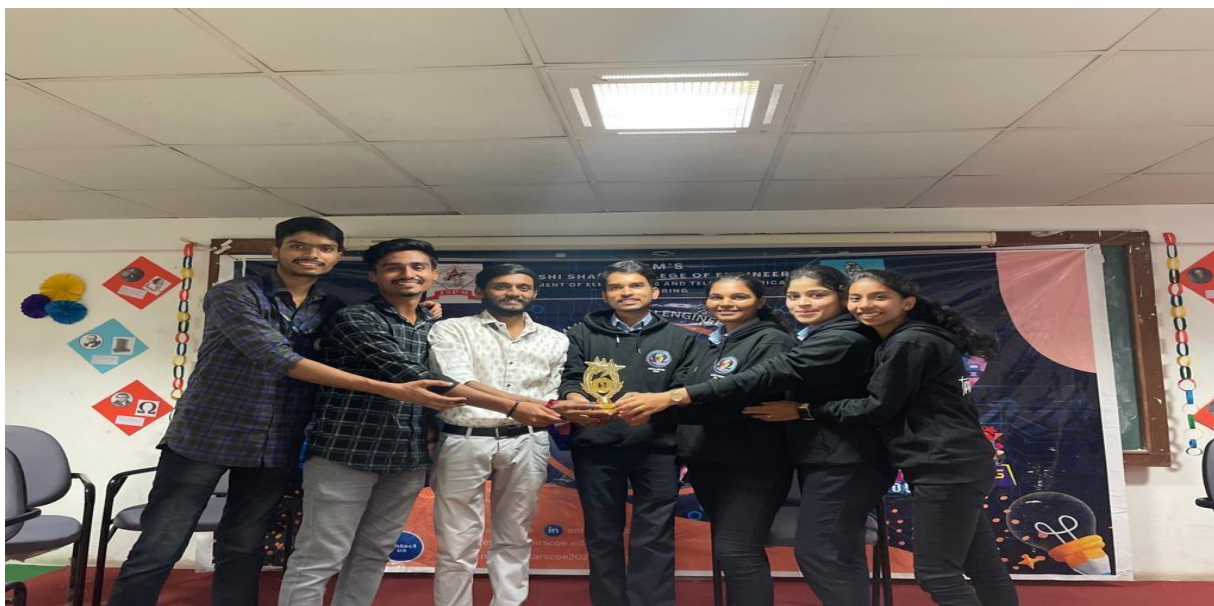
Felicitatation of team Cipher